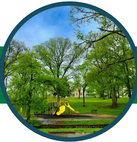
Host Park: SEVIER PARK

Our HOST PARK, SEVIER PARK , is located in the 12 South Neighborhood and plans to expand park amenities with new benches, soccer goals, a trail system, and a garden outbuilding. Our PARTNER PARK, KIRKPATRICK PARK , is located in the Edgefield Neighborhood and plans to expand the playground and increase community center programming.