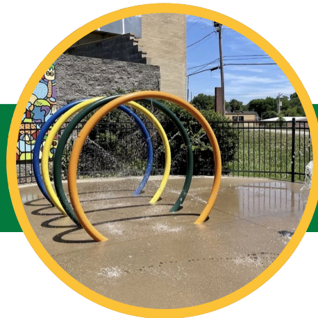
Partner Park: KIRKPATRICK PARK